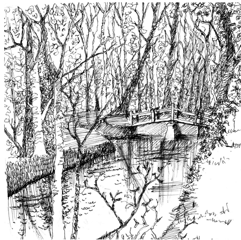
The Old Ford, Kingston Deverill by Pat Armstrong